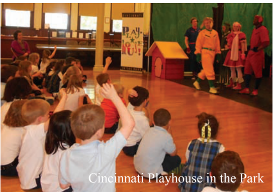
Cincinnati Playhouse in the Park