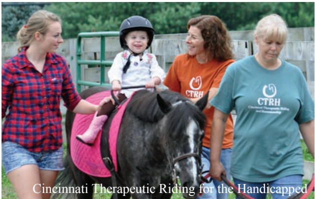
Cincinnati Therapeutic Riding for the Handicapped