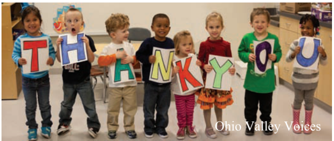
Ohio Valley Voices