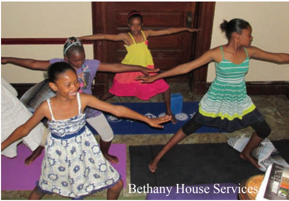
Bethany House Services