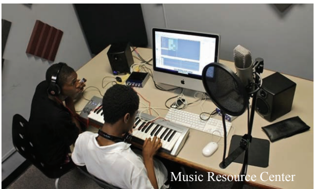
Music Resource Center