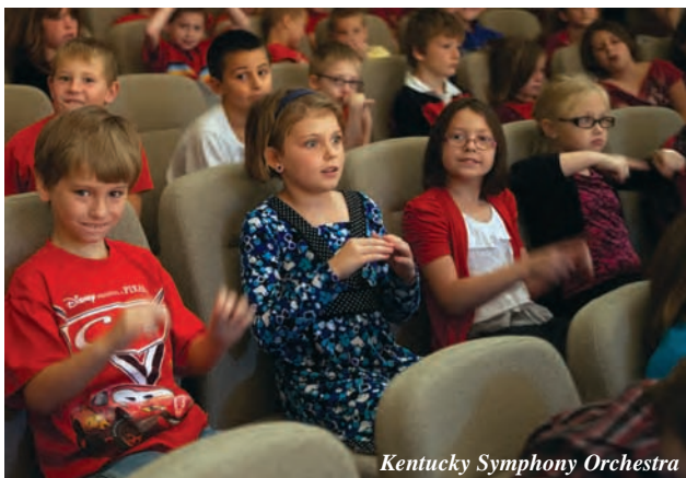
Kentucky Symphony Orchestra