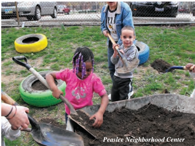
Peaslee Neighborhood Center