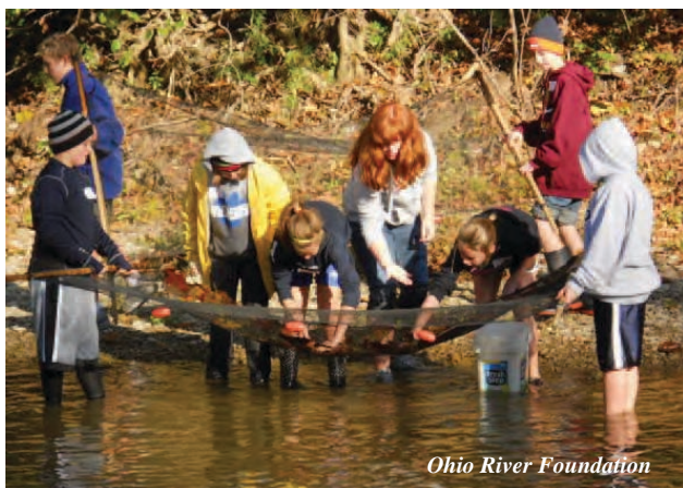
Ohio River Foundation