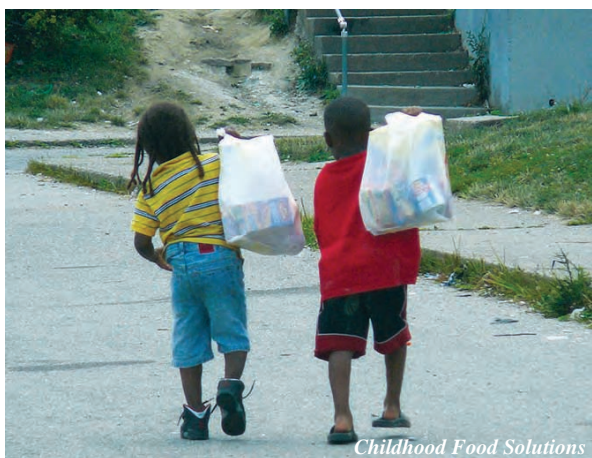
Childhood Food Solutions