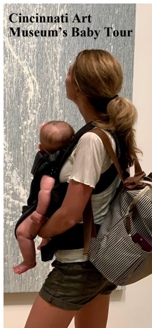
Cincinnati Art Museum's Baby Tour