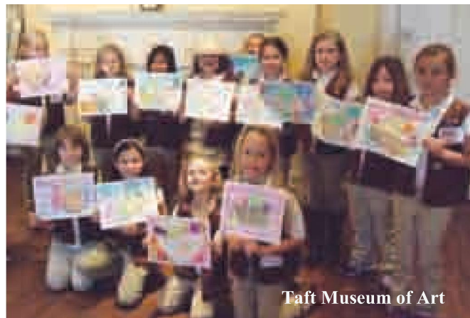
Taft Museum of Art