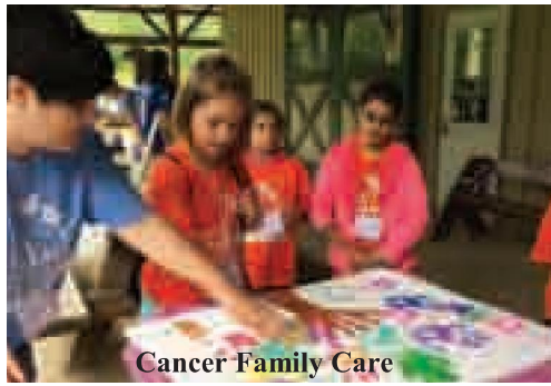
Cancer Family Care