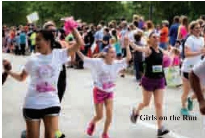
Girls on the Run