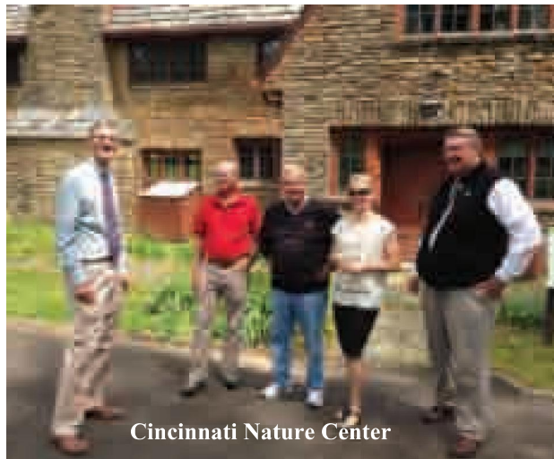
Cincinnati Nature Center