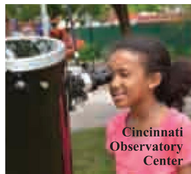
Cincinnati Observatory Center