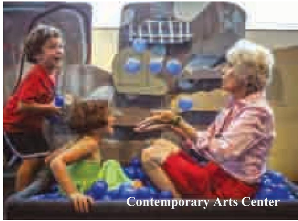
Contemporary Arts Center